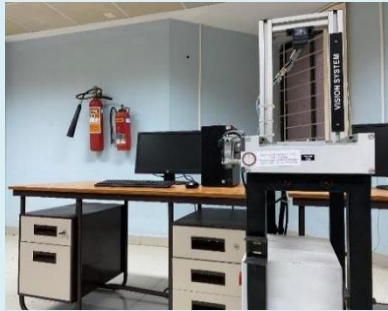
Component Inspection Platform