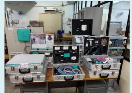
Sensorics Module from Pepperl & Fuchs (India) Pvt. Ltd