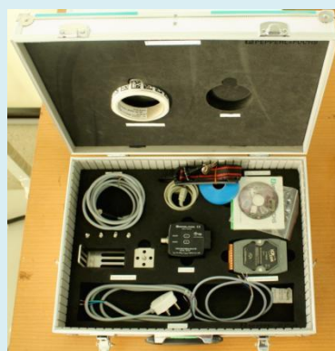
Position Guide Vision Kit