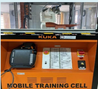
Robot mobile training cell-Full module from KUKA robot