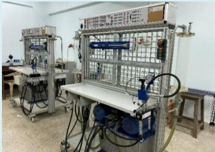
Hydraulic Control Module from Bosch Rexroth (India) Pvt. Ltd