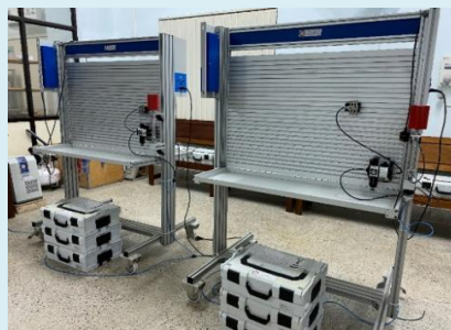
Pneumatic Control Module from Bosch Rexroth (India) Pvt. Ltd