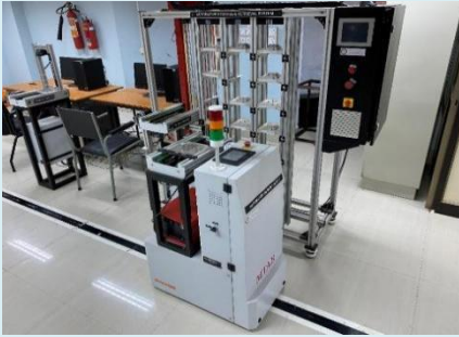
AGV based FMS Module from MTAB Engineers (P) Ltd.