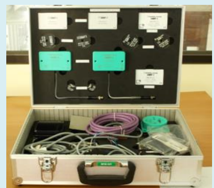
Radio Frequency Identification Kit